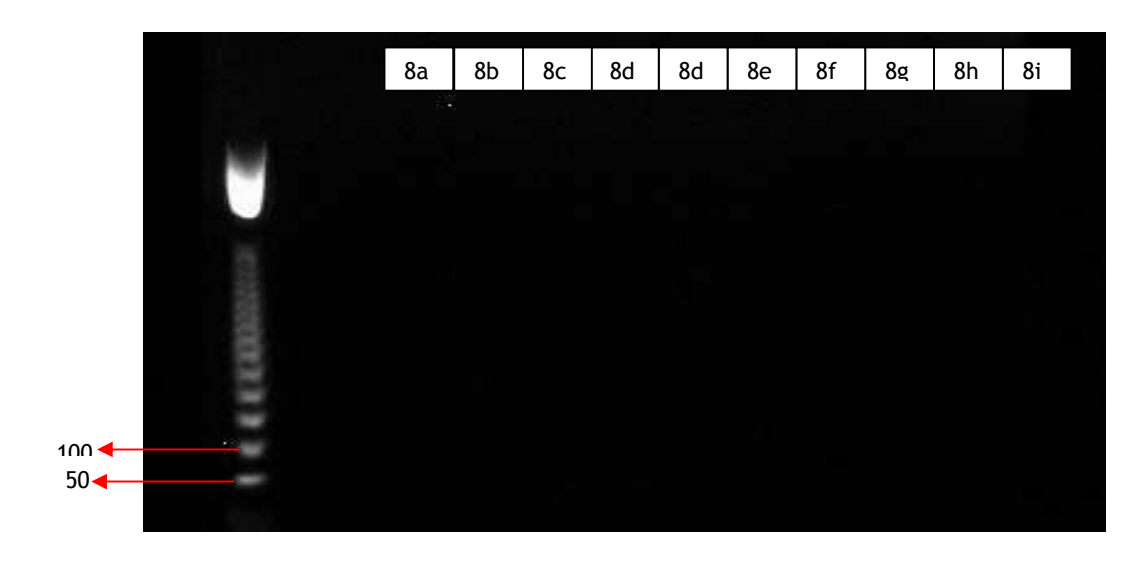
Fig1. This figure shows an image produced by Versadoc system of the gel electrophoresis of sample 8 that aimed at toxR gene. It shows a 50bp DNA ladder (Promega). No other bands were detected. 8a, d and g consisted of 0.1 ml of sample homogenate, 8b, e, h 0.01 sample homogenate and 8c, f and i 0.001 ml of sample homogenate as prepared during MPN procedure.