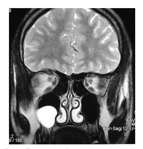
Figure 2: Coronal T2-weighted MR image shows a convex hyperintense lesion in right maxillary antrum suggestive of retention cyst/ polyp

Sinus opacification: Of the 114 patients with sinus opacification, 66(57.9%) were male and 48(42.1%) were female with male to female ratio of 1.37:1. The maximum number of opacification (Figure 3) was seen in maxillary sinus in 78 patients, followed by 72 in ethmoid, 26 in frontal, and 9 in sphenoid sinus (Table 3). Combined maxillary and ethmoid opacification was seen in 36 patients, combined maxillary and frontal opacification in 26 patients, and combined ethmoid and sphenoid opacification in 9 patients.