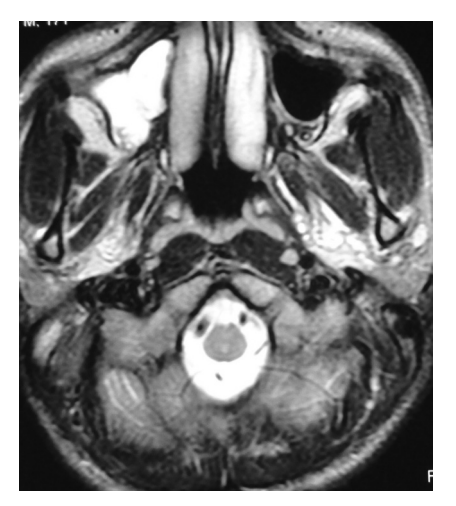
Figure 3: Axial T2-weighted MR image shows opacification of right maxillary sinus

Up to 2 mm of ethmoid sinus mucosal thickening may not be due to inflammatory disease but may reflect the normal intermittent congestion of nasal cycle which is cyclical passive congestion and decongestion of each side of nasal turbinate, nasal septum, and the ethmoid air cells mucosa