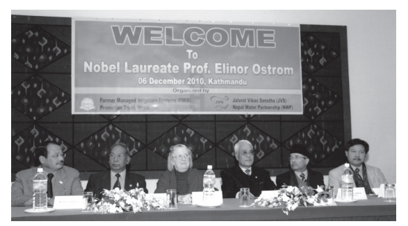
Late Elinor Ostrom Third from the Left in the Photo.