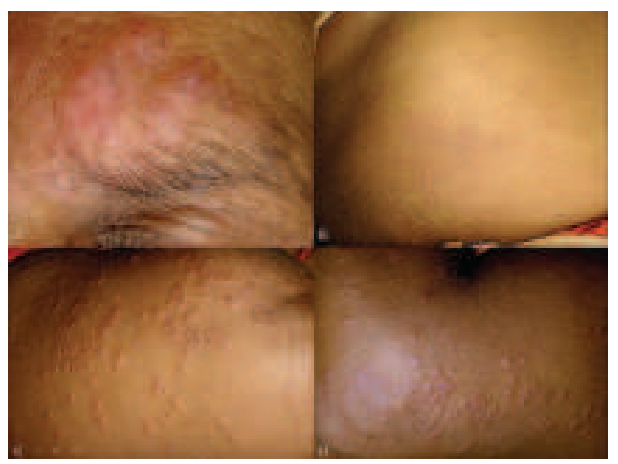
Fig.2. Annular lesions of granuloma annulare on the face (A), abdomen (B) and upper limbs (C,D).