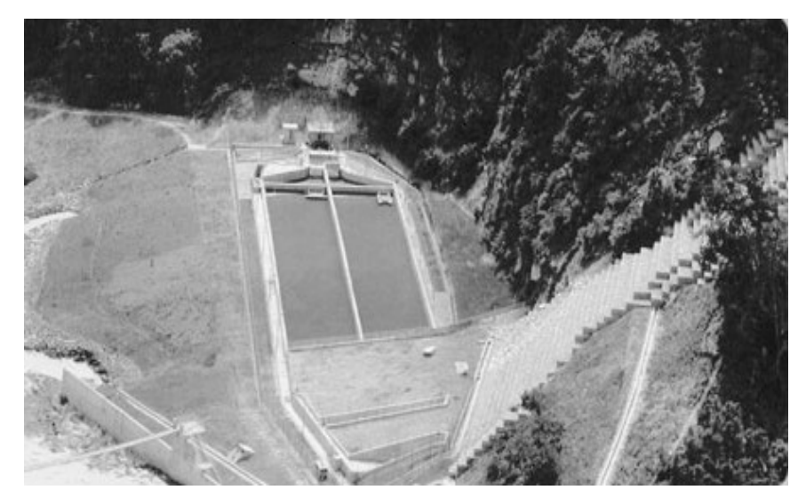
Figure 2: Khimti-I Hydro-Power Project