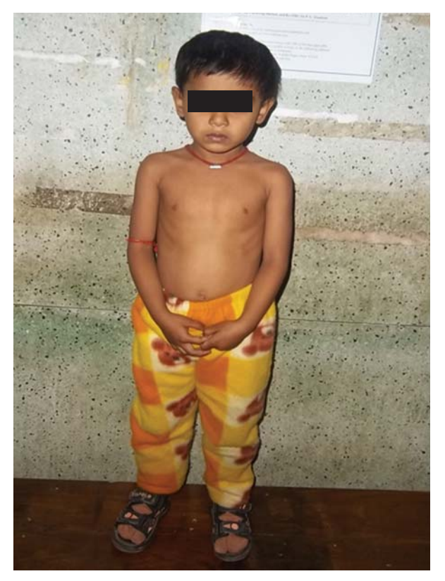
Fig 1: Showing the patient with Fahr's Disease at an early age

General survey revealed normal facies and anthropometric parameters. No neurocutaneous markers. Neurological examination showed no meningeal signs or signs of raised intracranial tension. Higher function, speech, cranial nerves were normal. There was no neurodeficit, paraesthesias, extrapyramidal symptoms or gait disturbances. Examination of all other systems was normal.