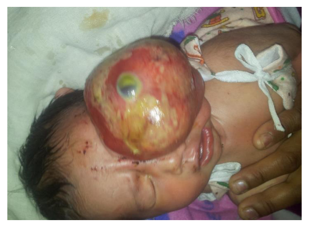
Figure 2: The orbital mass is seen pushing the globe anteriorly (note the keratinized cornea)

Upon inquiry she was born to a healthy 21 years old mother following an uneventful pregnancy and delivery events and with no other systemic abnormalities. On clinical examination, the child was alert and stable with normal breathing and colour. Ocular examination showed upwardly displaced left eyebrow, stretched evelid and keratinized conjunctiva. However, other details of the globe regarding anterior and posterior segment as well as the fundal glow couldn't be appreciated. Upon examination of the mass, it was extending beyond the orbital rim, reddish, globular, smooth, with no rise in temperature, measuring 5*5*5 cm, variable (cystic to firm) in consistency, absent pulsation, positive fluctuation, partial illumination and no bruit on auscultation. With co-ordination from pediatrics and neurosurgery departments, the child was admitted in our ward for further management.