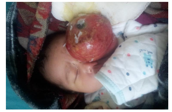
Figure 1: The child with left orbital mass at the time of presentation.

of left eye which they noticed since the time of her birth. The swelling was progressive. The estimated size of the swelling was about that of a tomato at birth which progressed rapidly to become the size of a small coconut before they seeked any medical attention. They initially went to nearby district hospital and then to Bhairahawa and finally referred to our centre.