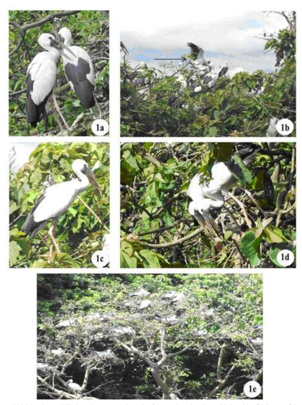
Figures: 1(a) Mated open billed storks occupy a branch of tree and resting there side by side, (b) Successful cloacal contact occurred during copulation when male stork stood on the back of the female stork on the tree, (c) The male stork collecting the branches of tree, (d) The male stork remains with the female to arrange the materials in the nest, (e) The female stork incubating the eggs and standing on the nest.