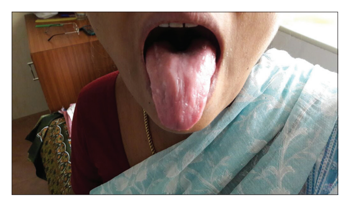
Figure 1: Glossitis

PVS is a rare entity with an unclear pathogenesis. IDA has been implicated as the most probable mechanism. The depletion in the iron dependent oxidative enzymes can lead to myasthenic changes in the muscles of deglutition, atrophic changes in the oesophageal mucosa and formation of epithelial webs. The symptoms of dysphagia show improvements following iron therapy.<sup>1</sup> However, there have been instances where the patients did not respond to iron therapy and eventually required endoscopic dilatation or incision for the treatment of dysphagia.<sup>2-4</sup>The occurrence of post cricoid web is a risk factor for the development of squamous cell carcinoma of gastrointestinal tract.5 In cases of haemorrhoids, a rapid correction of anaemia has been noticed with hemorrhoidectomy.<sup>6</sup> PVS has also been observed in conditions like celiac disease, thyroid disorders and rheumatoid arthritis.7-9