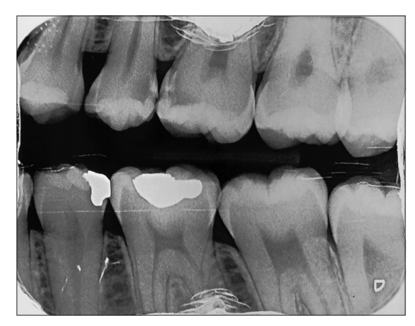
Figure 1: Bite wing film shown proximal caries