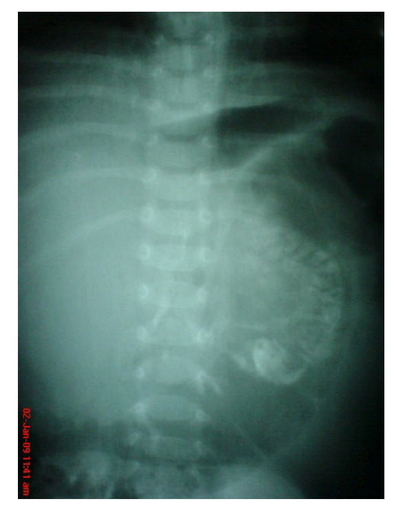
Fig.1 : Plain X ray abdomen AP view shows well formed vertebra of the fetu on the left side. Few facial bones, skull base and one femur are also seen.

X ray erect abdomen antero posterior and lateral views (Fig. 1) showed a soft tissue density shadow in left side of upper abdomen displacing bowel loops. A curved vertebral column like bony appearance to the left of the patient's vertebral column was noted.