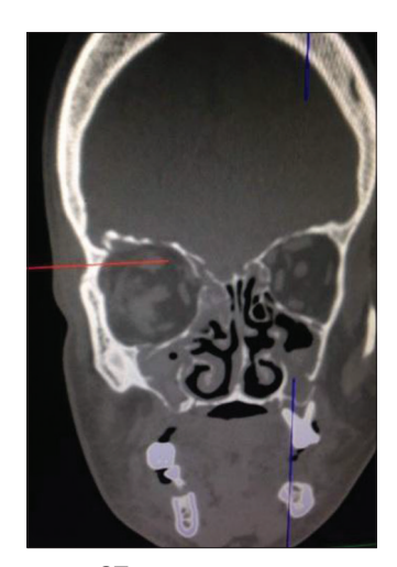
Figure 1: Pre operative CT