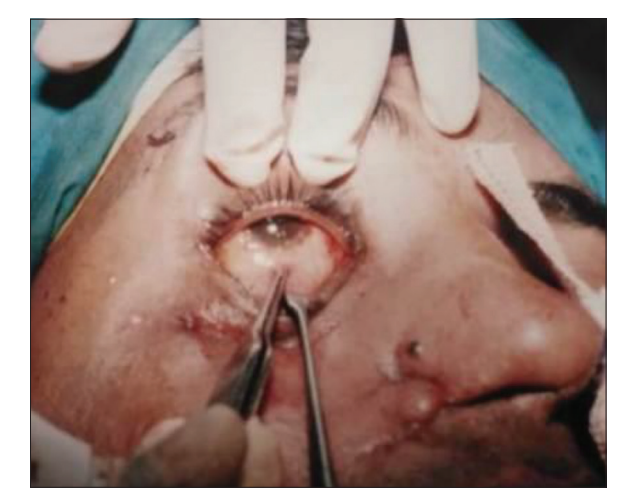
Figure 5: Forced duction test after placement of the graft