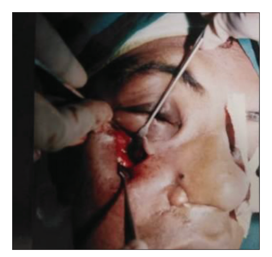
Figure 3: Exposure by infra orbital approach