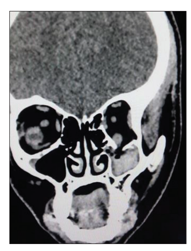
Figure 8: Coronal CT-Rounding of inferior rectus

Figure 7: Pre-Operative enopthalmos and diplopia -12 th day of injury