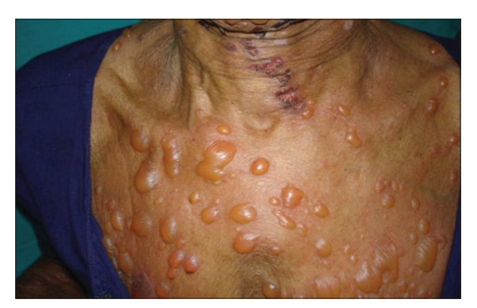
Image 4: Lesion in Bullous pemphigoid – Large tense bulla can be noted on the chest areas

range for BP was between 34 to 81 years with mean age of presentation being 57.72 years in contrast to previous study mean age of presentation ranges from 60 to 75 years.<sup>5</sup> Majority of our patients presented at 5<sup>th</sup> decade or later.