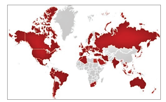
Figure 1: Spatial mapping of web queries. *Date: 01/12/2019 to 01/12/2020

Principally, spatial mapping conveyed data concerning the first two search topics; SARS-COV-2 and COVID-19. Data signals originated from 46 countries; the first twenty of which included Canada, New Zealand, Portugal, Ireland, South Africa, France, Chile, India, Australia, United States, Peru, United Kingdom, Mexico, Ecuador, Romania, Colombia, Indonesia, Spain, Thailand, and Brazil (Figure 1). Only six nations (13.04%) from the Arab world and the Middle East contributed to the holistic map, including Iran, Turkey, Morocco, United Arab Emirates, Saudi Arabia, and Egypt. Concerning the other three search topics; "Pediatric Encephalopathy," "Pediatric Encephalitis," and "Encephalitis in Children," geographic