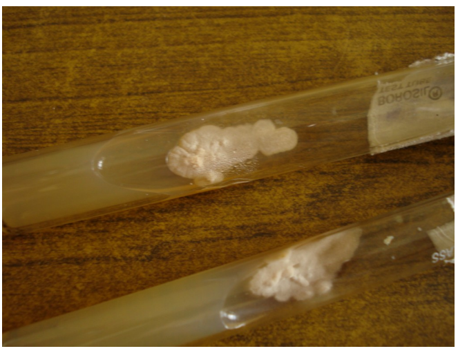
Figure-1: White cottony, floccose and spreading growth on Sabaraud's Dextrose Agar

confirmation of species was done by subculture of growth on cornmeal agar. No cleistothesium formation was seen from growth on cornmeal agar thus confirming the diagnosis of Scedosporium prolificans in contrast to Scedosporium apiospermum . Followed by the initial report, debridement of the affected eye was done by the ophthalmologist and the patient was treated with Natamycin 5% eye drops and oral Ketoconazole 200 mg. The patient responded well with only a minimal scar on the cornea seen after one month and was advised regular follow-ups.