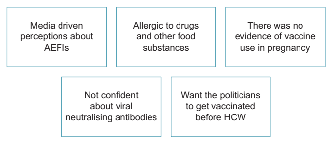
Figure 2: Personal views on vaccine hesitancy

only depend on the efficacy of the vaccine itself but also on the population's willingness to accept it.<sup>11</sup> In our study, prevalence of vaccination hesitancy during the period January 25, 2021–February 24, 2021, was found to be