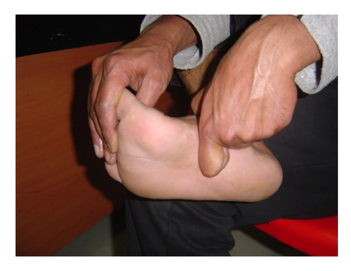
Figure-1: Specific stretching exercise of plantar fascia

Out of 50 patients, 36(72%) were female and 14 (28%) were male. 36(72%) were left sided and 14 (28%) were right. Mean age of patients were 46.12\pm SD7.11 years. As per the Table 1, the pre treatment mean visual analogue scale score for all patients is significantly higher than every follow up (p=0.0001).