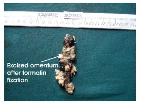
Figure 2: Elongated prolapsed omental mass

The elongated yellowish soft tissue mass measured 9x2.5x1 cm. Cut section showed lobulated yellowish areas with haemorrhage (Fig-2). Microscopic examination revealed lobulated omental fat. The interstitium showed mixed inflammatory cell infiltrate, acute vasculitis and congested blood vessels (Fig-3). No cervical or endometrial tissue was seen.