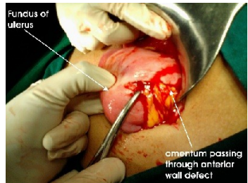
Figure-1: Intraoperative photograph showing defect in the anterior wall of uterine fundus with omentum passing through it

A 24 year old unmarried female presented with bleeding per vagina since 15 days. Per speculum examination showed a mass protruding through the cervical os into vagina with serosanguineous fluid. She had undergone medical termination of pregnancy (MTP) outside 15 days back at 5th month of gestation by a nonallopathic doctor. Ultrasonography (USG) revealed a defect in the fundus of uterus. Emergency laparotomy was done. Uterine perforation of about 2 cm in size was seen in the anterior wall of uterus with the omentum passing through it (Fig-1). Hemoperitoneum was present. Omentum inside the endometrial cavity and vagina was taken out through the vaginal route and sent for histopathological examination. Both ovaries and fallopian tubes were normal. No damage to bowel was noted.