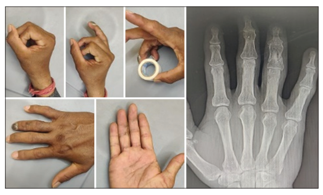
Figure 2: Post-operative functional outcome and X-ray for above case