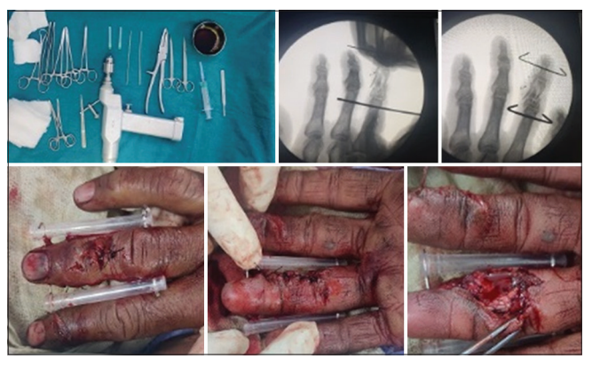
Figure 1: Instruments used during surgery and steps in using this fixator showing tendon repair over the fixator

This had shown a mean of 232.3 and S.D of 32.3. According to this scale, the outcome in our study was