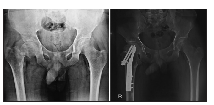
Figure 1: Femoral neck fracture with complete displacement (left), post-operative X-ray following fixation by dynamic hip screws with two CC screws (right)

Post-Operative X-Ray was taken (Figure 1). Patients were allowed partial weight-bearing and walking with support immediately after surgery. Full weight-bearing was allowed during follow-up on the basis of radiographs after the assessment of callus formation. Modified Harris hip score was used to asses functional outcome in studied cases. At the end of last follow-up, functional outcome was excellent to good in 47 (58.75 %) patients whereas fair and poor