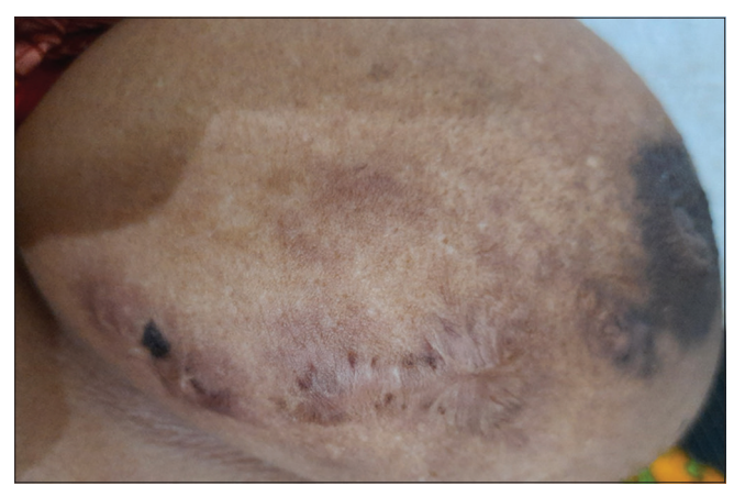
Figure 3: After treatment of idiopathic granulomatous mastitis

showed resolving abscess with sinuses. Pus culture ruled out tuberculosis. Tru-cut biopsy confirmed diagnosis of IGM. She advised broad-spectrum oral antibiotics, analgesic, regular dressing, and other supportive measures. The patient was explained regarding the disease process.