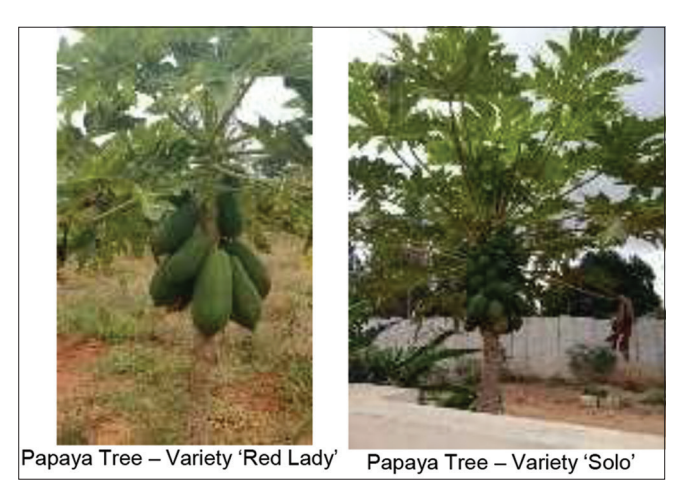
Figure 1: Papaya trees – two varieties used in the study

An increase in the platelet count from baseline level to the end of therapy was considered as the primary outcome. Change in the hematocrit levels from the baseline levels to the end of therapy and comparison of incidence and rate of adverse events that occurred between the two arms to evaluate the safety and tolerability were considered secondary outcomes for the study.