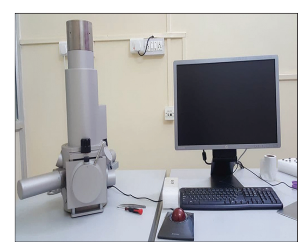
Figure 1: Scanning electron microscope

Premolar teeth, required for orthodontic treatment, were obtained from various dental clinics. As the responsible