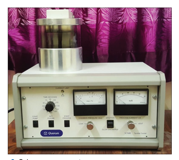
Figure 2: Subpressure apparatus