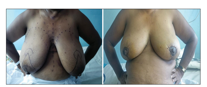
Figure 1: Wise pattern reduction mammoplasty: on left, pre-operative and on right, post-operative day 7

The most common presentation was breast and musculoskeletal pain which was present in all patients for an average of 2 years. A majority of the patients attributed the pain to macromastia but were reluctant to seek medical advice or openly discuss with medical professionals regarding their suffering. This was mainly due to a lack of knowledge about the clinical diagnosis of macromastia as a