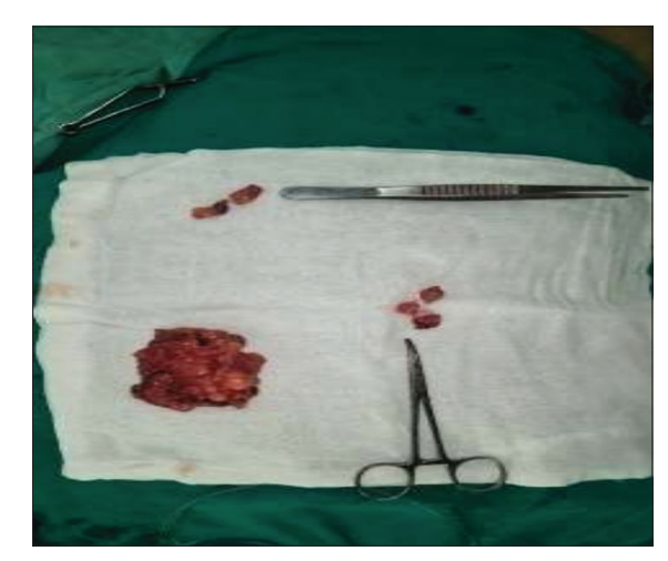
Figure 3: Blue stained node along with perilymphatic fat