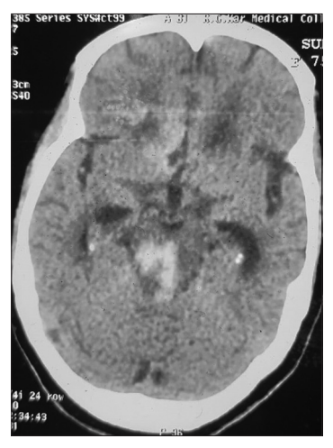
Figure 2: Pontine hemorrhage