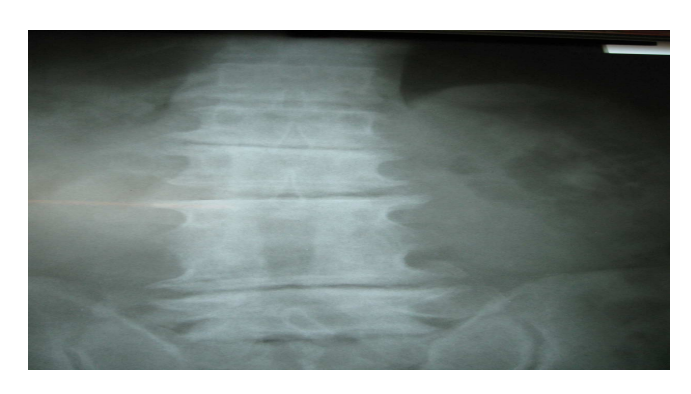
Fig 1. Anterior-posterior lumbosacral radiograph showing effacement of L3-L4 disc space and narrowing of other disc spaces as well as marginal osteophytes from L1-L5

families, communities, governments and businesses throughout the world <sup>5</sup>. These young age group involvement in LBP is because they are the group involved in jobs requiring manual labor, static posture, whole-body vibration, repeated heavy lifting, lifting while twisting, flexion and rotation of the trunk <sup>15,16,17</sup>. There is some suggestion that when work requirements or heavy lifting exceed individual capacities like blue-collar jobs, back pain is more likely to occur<sup>16,21</sup>.