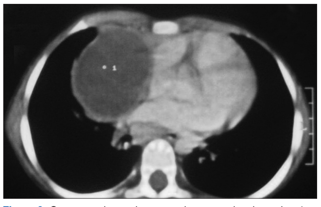
Figure 2: Contrast enhanced computed tomography showed a giant cystic mass located in middle mediastinum, compressing the right atrium