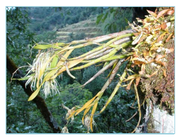
Fig 3: Dendrobium eriiflorum