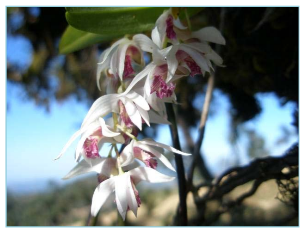
Fig 2: Dendrobium denudans

Altogether 36 species of orchids were recorded and identified in the studied 17 VDCs of Rolpa district. Among them, 31 species were identified up to species level, two species were identified up to generic level and the remaining three were not identifiable. The list of recorded orchids is given in Table 1. A total of seven species of Dendrobium were recorded from the surveyed VDCs. Similarly, four species of Coelogyne were recorded. Of all the recorded orchid species, two species of Dendrobium ( D. denudans and D. eriiflorum ) are traded from the district.