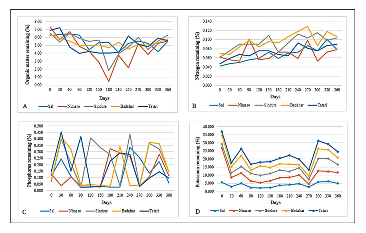
Figure 3a: Remaining OM (%) with time; Figure 3b: Remaining N (%) with time; Figure 3c: Remaining P (%) with time; and Figure 3d: Remaining K (%) with time

The remaining P concentration with time was more or less similar for all the species. The initial concentration was highest in F. hookeri (21.159%) followed by A. lakoocha (5.295). The amount of P was found to have dramatically decreased during the first month for all the species and increased in the second month and again decreased in the third month (see Figure 3d). The rate slightly fluctuated again at the last two months of the study period. The net release of P was highest in F. hookeri followed by A. lakoocha .