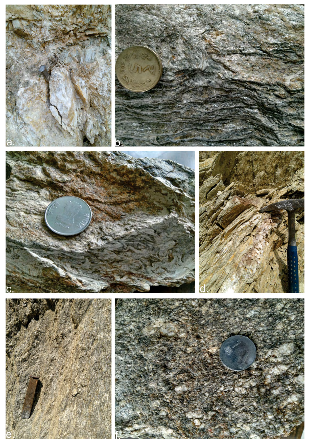
Fig. 2: (a). Quartz intrusion in phyllites at Syaldey, (b). Phyllites exposed at Ruchaikhal, (c). Well developed crenulations in phyllites exposed near Udaipur, (d). Phyllites exposed at Kueta, (e). Gneisses exposed at Wolmara, (f). Augen gneiss at Patharkhola, (g). Augen gneiss at Tamadhum.