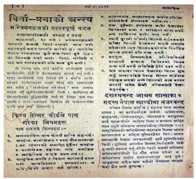
Pix no. 1. Rules of film Censor Board published in Jagaran ( Jagaran , 1951, p. 8)<sup>2</sup>