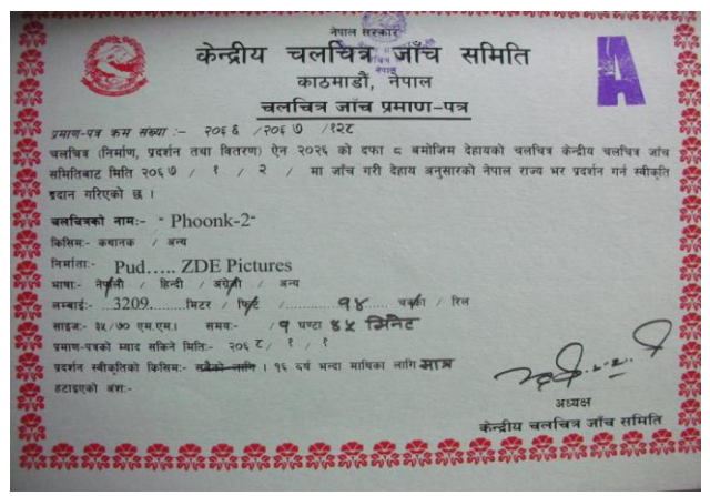
Pix 4. Censor board's certification of phoonk-2.

In pix 4 there is censor board's certification for Indian cinema phoonk-2 .