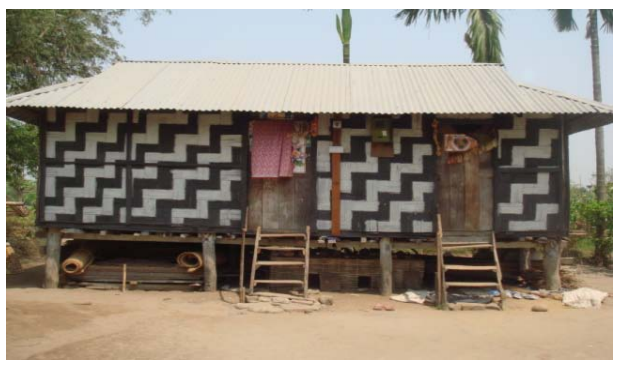
A Kisan house for community meeting