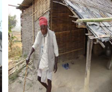
A Kisan house used for offices of the Kisan court and the club