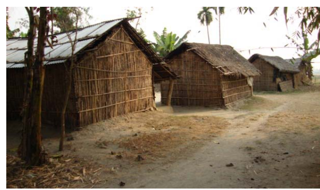
Kisan houses are turn opposite of the road