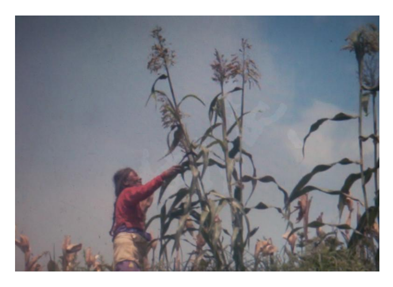
Figure 4: Woman harvesting sorghum outside Village of Nagarkot

Millet is a key element in rituals among in both the villages of Argal and Tangram, though it appears to play a more significant role in Argal. Sorghum is a sacred grain, especially puffed