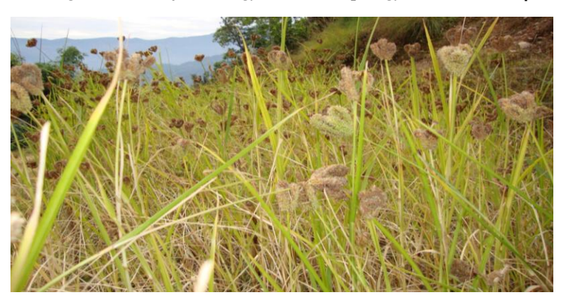
Figure 3: Finger millets growing in the village of Argal