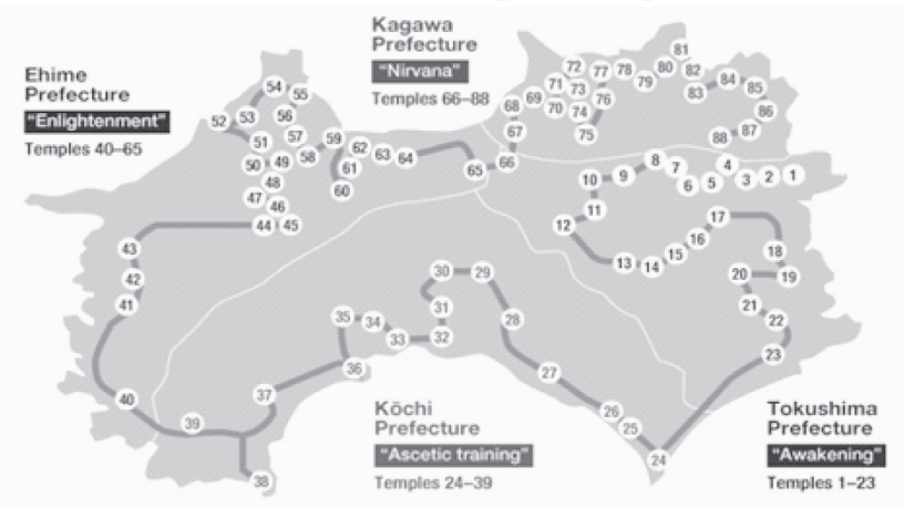
Figure 1: Shikoku Island and location map of 88 temples

Japan with a highly developed pilgrimage culture which is one of the most prominent elements in Japanese religious structure (Reader, 2005: 9). The Shikoku pilgrimage has become an international pilgrimage destination. People with other religious faiths than Buddhism also make pilgrimage in Shikoku.