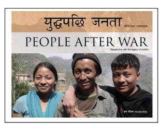
Cover page of 'People After War'<sup>5</sup>

One of the imminent journalists of Nepal, Kunda Dixit published a pictorial book entitled 'a people war' in 2006 containing images of