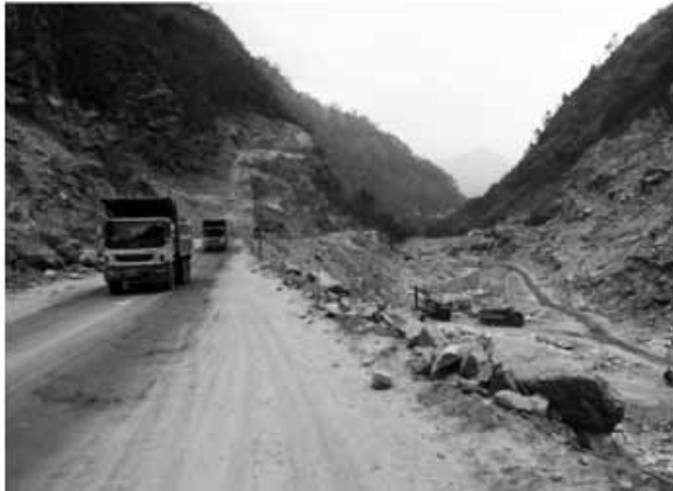
Photo 1. The ongoing Punatsangchhu construction in Punakha Wangdue valley

De-commissioning of dams is said to be one of the best remedies for restoring river health. But it is common