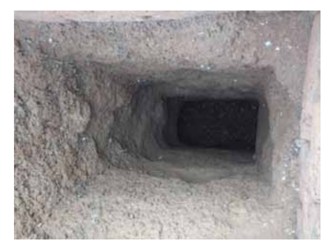
Figure 7: Qanat 3