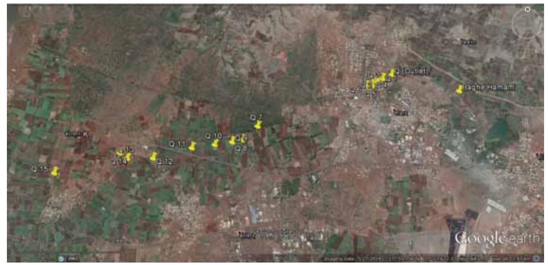
Figure 3: Location of Qanats at Bidar

Around 1.5 kms east from outlet of the ganat system at Naubad village, there is remnants of Deccan sultanate structure identified as Bagh-e-Hamam (Figure 19). The preliminary investigation at Bagh-e-Hamam appears to be a water structure. The structure has three platform levels approximately 2 m in depth. In orientation, the north-eastern side indicate as an outlet to the structure, which has reveal horizontal and vertical terracotta pipes. The horizontal pipe channelizes the water outward whereas vertical pipe control the flow of the water towards the Hamam. The north-western side has revealed outer edge of the structure along with the stone pillars and rooms whereas south-eastern and south-western side of the structure is intact. The south-western side has revealed seven arches and there are steps behind the arches, which indicate that the arches have storeyed structure? On the southern side there presume to be huge structure related to the water body, which require further investigation in this regard.