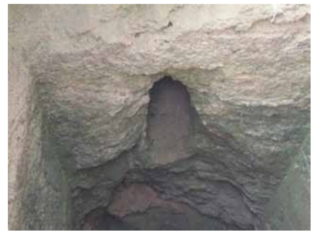
Figure 18: Qanat 14