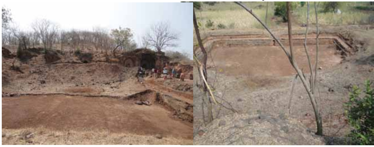
Figure 19: Bagh-e Haman at Naubad vilage