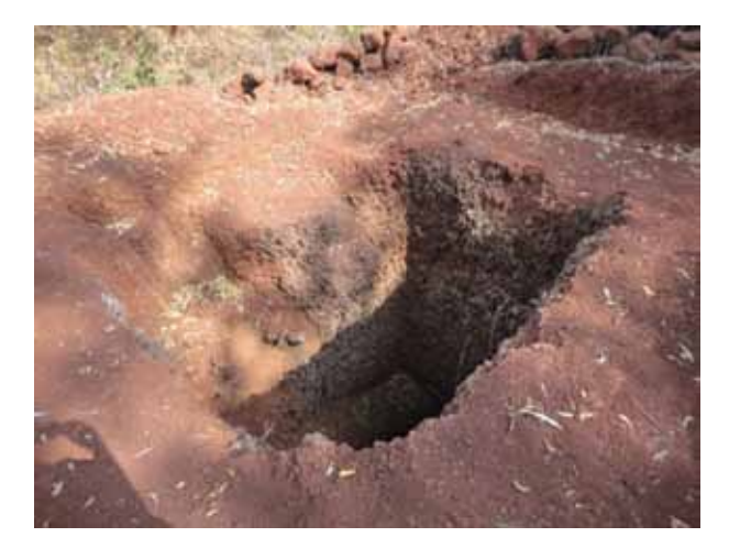
Figure 5: Qanat 1