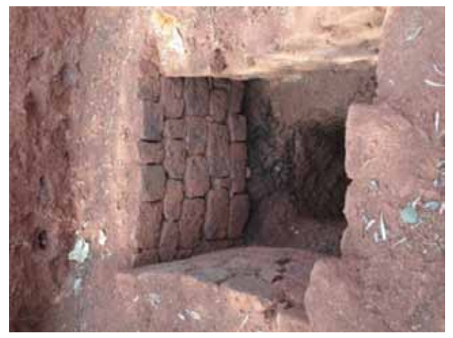
Figure 6: Qanat 2