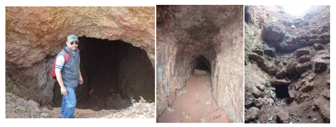
Figure 4: Qanat Outlet