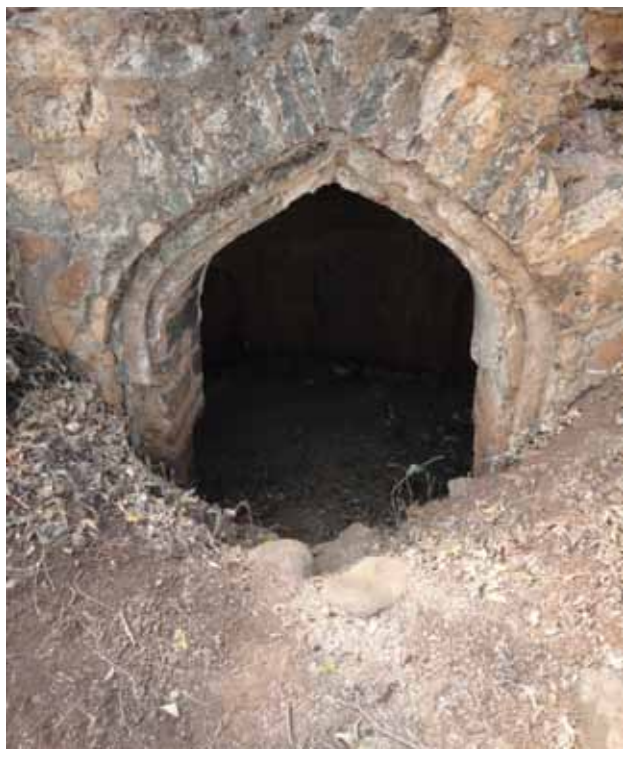
Figure 19: Bagh-e Haman at Naubad vilage

Cousens, H. 1926. The Architectural Antiquities of Western India. Publication by The Indian Society,