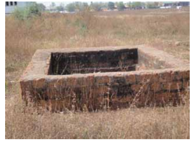
Figure 8: Qanat 4