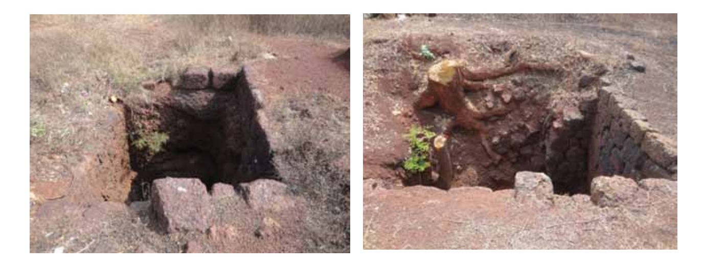
Figure 9: Qanat 5