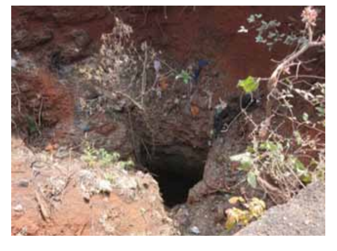
Figure 12: Qanat 8