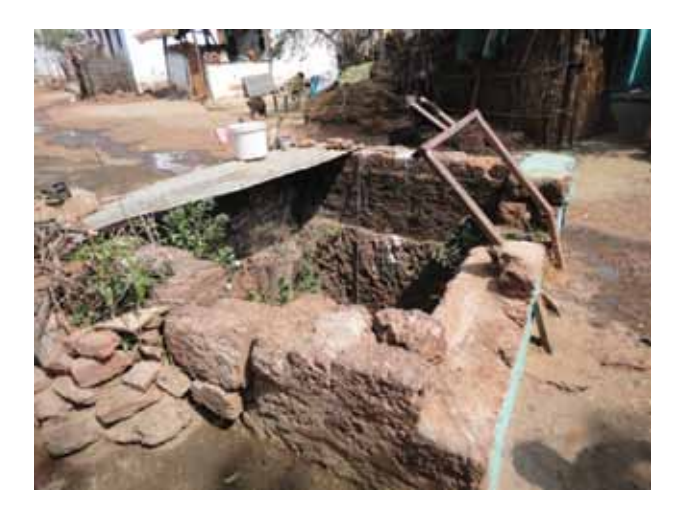
Figure 13: Qanat 9