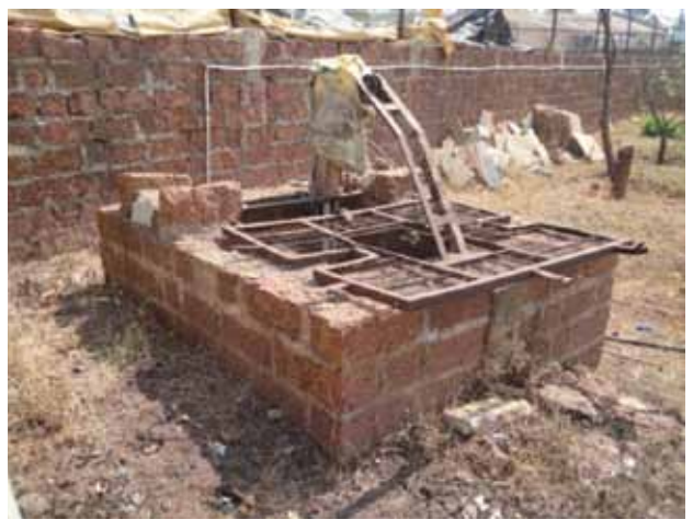
Figure 14: Qanat 10