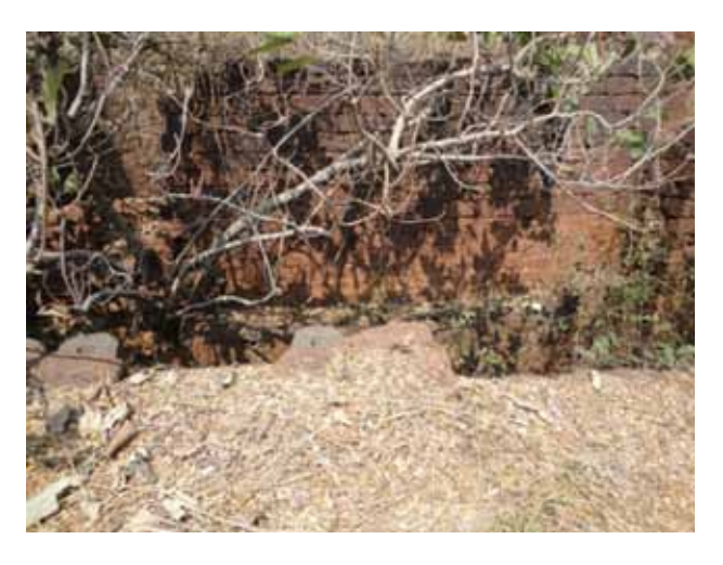
Figure 17: Qanat 13