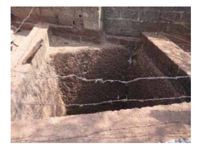
Figure 11: Qanat 7