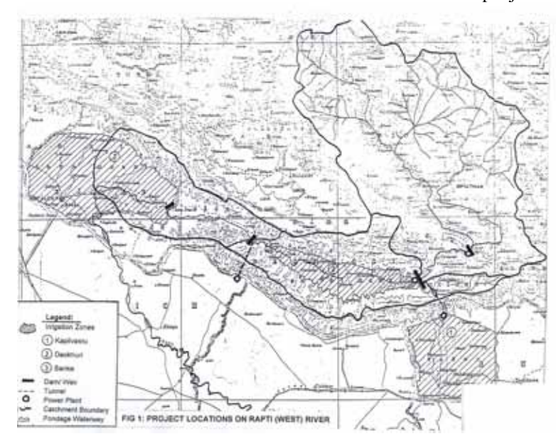
Figure 1: Project Locations on Rapti (West) River

The Rapti (West) river is formed by joining Mari Khola with Jhimruk Khola. The main Rapti course from the confluence is about 185 km long before crossing the Nepal - India border. It flows through Deokhuri valley towards west. The Deokhuri valley floodplain lies in the north of Dunduwa range. Before entering the Banke flood plain, the Rapti river is confined at Sikta to a narrow valley between Siwalik range in the north and Dunduwa range in the south. At the entry to Banke floodplain, the river turns southwards and receives Dunduwa Nadi (River) as a right tributary and then after flowing through Banke floodplain enters into India (See Figure 1).