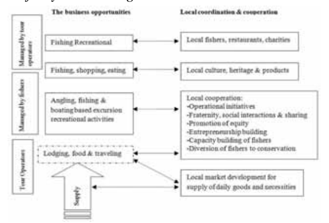
Figure 1: Fishing tourism linkage into the local economy for livelihood support to fishers fish poor fisfishers fishers

Fishing tour could be organized in close collaboration and cooperation between tour operators and local fishers. The fishing tourism would also involve occasional shopping, eating, boating excursion and other recreational activities. The fishing tourism might involve fishers as guides, transporters and merchants of local agriculture and livestock fish products (Figure. 2). It has been stipulated that involvement of traditional fishers in different jobs and income opportunities such as in transportation and service sector created by fishing tourism would divert majority from fishing to other income activities.