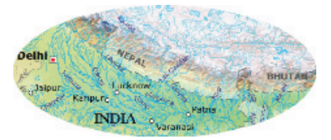
Figure 1. Rivers in Nepal and North India

With more than 6,000 rivers and rivulets in Nepal, as per Hydro Solutions' estimates, the total hydropower potential of Nepal stands at around 200,000 MW against the popularly assumed, figure of 83,000 MW. The northern part of the country has numerous projects with high headworks, the mid-hill region has potentials for small and medium sized projects, and in the southern parts where 6,000 rivers merge to make the huge rivers like Mahakali, Karnali, Narayani and Koshi, there is a high possibility of generating hydropower through larger projects like Sapta Gandaki (600 MW), Pancheswor (6,400 MW), Karnali Chisapani (10,800 MW) and Sapta Koshi (3,500 MW). This potential (one million GW hour of electricity) is adequate to meet the total domestic and part of regional energy demands for many years.