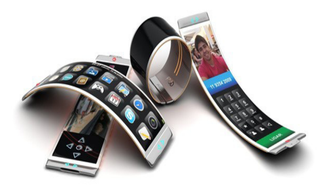
Fig. 1. Future generation cell phones

The nomenclature of the cellular wireless generations (G) generally refers to a change in the fundamental nature of the service, non-backwards compatible transmission technology and new frequency bands. New generations have appeared about every ten years since the first move from 1981 analog (1G) to digital (2G) transmission in 1992. This was followed in 2001, by 3G multi-media support, and in 2011 by 4G, which refers to all-IP switched networks, mobile ultra-broadband.