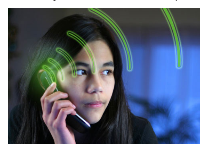
Fig 3: Emission of radiation from cell phone while in use It may cause irreversible hearing loss. Finally, it leads to ear tumor

microwave radiation from the cell phone heats the blood in the ear lobe and its temperature increased by nearly 1.80°F, causing the normal body temperature of 98.40°F to rise to 100.20°F. This leads to ear pain, haring loss and ear tumor. On the other hand when we continuously use cell phone for about 20 minutes, temperature of ear lobes increases by 1°C.