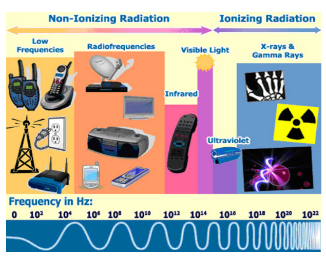
Fig 2: diverse uses of electromagnetic radiation

Besides mobile communication, the radio frequency in the microwave and radio spectrum is used in a number of practical devices for professional and home use. The cordless phones operating at a wide range of frequencies, remote control devices for opening gates, portable two-way radio communication devices, such as walkie-talkies wireless security (alarm) systems, wireless security video-camera, radio links between buildings for data communication, baby monitors, smart meters and so on. These devices are in frequent touch with the concerning people as well as nearby public. There are other kinds of ionizing radiation such as X-ray or gamma rays, relatively more harmful to our body. Unlike ionizing radiation radio frequency fields cannot cause ionization or radioactivity in the body.