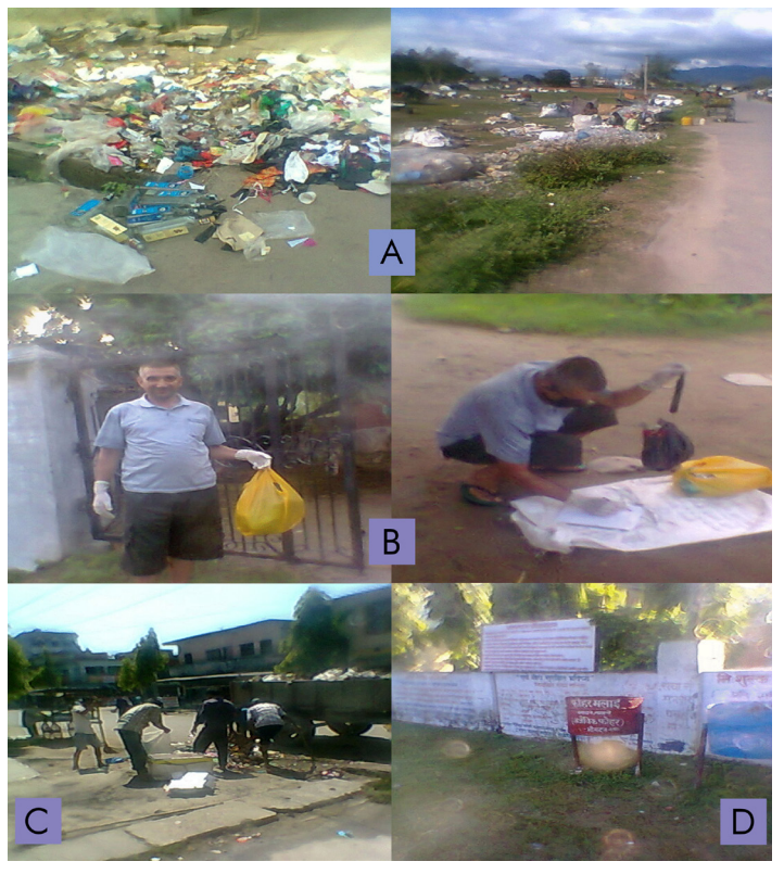
Figure 1. Solid waste management scenario at Bhimdatta Municipality. A: Solid waste thrown haphazardly in street; B: Author collecting (left) and weighing the solid waste (right); C: Municipal staff collecting the waste for disposal, and D: Dustbin in street side and public information for solid waste disposal.

A written permission document for this study was taken from District Administration Office Kanchanpur. Similarly, ward-wise information was collected from the municipal office of Bhimdatta Municipality.