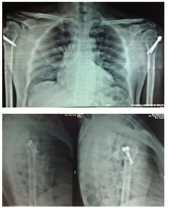
Figure 3a and 3b: Three months postoperative anteroposterior and transthoracic lateral radiographs showing union of bilateral greater tuberosities fracture

Radiographs of both shoulders showed union of both greater tuberosity fracture (Figure 3a and 3b).