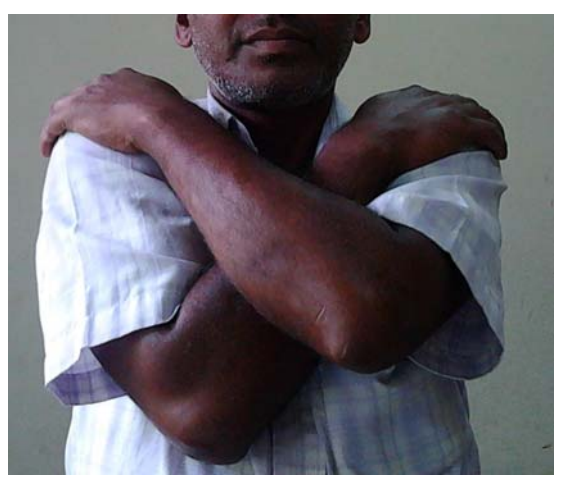
Figure 2a and 2b: Three months post-operative clinical photographs showing satisfactory range of motion.

The joints dislocated with minor degree of movements even with well applied shoulder derotation immobilizer. So, these reductions were unstable and needed fixation of both sides greater tuberosity with cannulated cancellous (CC) Screw. Both shoulder joints were immobilized for 3 weeks and subsequent rehabilitation yielded a good outcome. At 3 months follow-up, he was very happy with stable and satisfactory range of motion of both shoulders (Figure 2a and 2b).