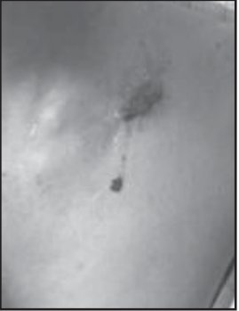
Fig. 1: Dischaging sinus over left Clavicle