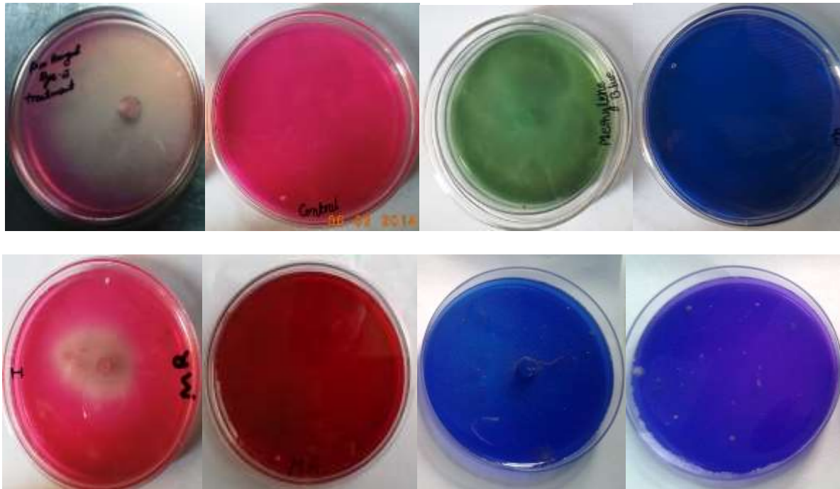
Fig. 1: Dye decolorization by isolate CPR4 on agar plate medium containing (1) Rose Bengal, (2) Methylene blue, (3) Methyl Red, (4) Coomassie Brilliant Blue. In each set of figure, control petri plate is at right side

and strain level. In this study, fungal molecular identification of the most active isolate CPR-05, based on 18S ribosome RNA sequence analysis showed that isolate CPR-05 was identified as Aspergillus niger species. The percentage of identity was found to be 96%. Phylogenetic tree analysis indicated that 18S ribosome RNA sequence of CPR-05 strain was closely related to Aspergillus niger (Fig. 2).