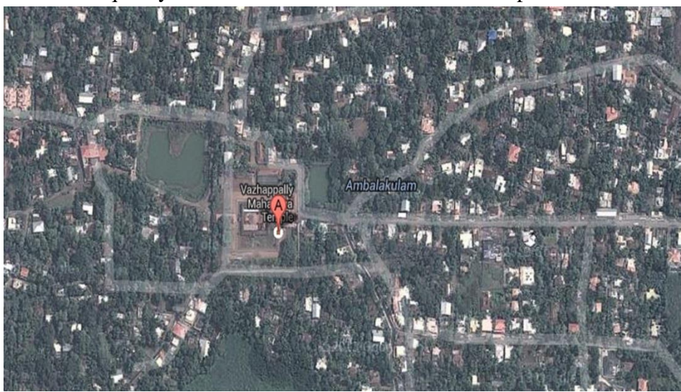
Figure 1. Satellite View of the Study Area

but from every corners of the world. Water is available during dry season also. But people are less scared about the quality of water and the side effects of water pollution.