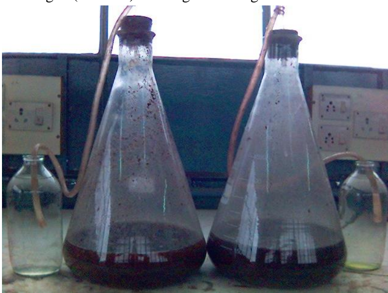
Figure 1. Anaerobic batch reactors with gas collection

Poultry litter was collected from the Live Stock Research station of Sri Venkateswara Veterinary University (SVVU), Rajendranagar, Hyderabad, Andhra Pradesh, India in sundried conditions. The litter was brought to work place as per requirement and stored in dry condition. Poultry litter slurry was prepared from the same storage and fed to the digester everyday as per requirement. The experimental set up consisted of 5litre anaerobic conical flasks and biogas vent through water reservoir as shown in Fig.1. Initially, fresh poultry droppings were characterized for pH, Total solids (TS), Volatile solids (VS), Fixed solids (FS), Total Kjeldahl nitrogen (TKN), Ammonical nitrogen (NH4- N) and Organic nitrogen.