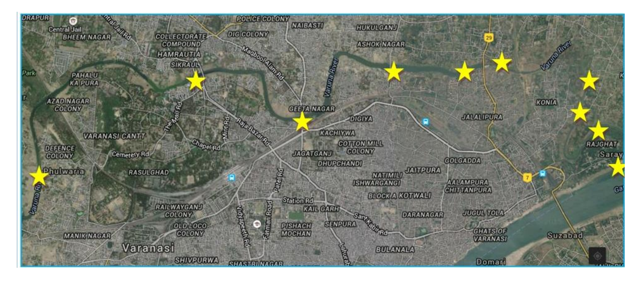
Figure 1: Sampling locations at Varuna River Stretch

The selected water quality parameter were Temperature, pH, Electrical Conductivity (EC), Biological Oxygen Demand (BOD), Chemical Oxygen Demand (COD), Total dissolved Solids (TDS), Total Hardness (TH), Dissolved Oxygen (DO), Total Alkalinity (TA), Total Acidity (TA), Chloride, Nitrate following the standard protocols of APHA (2005) (Rana and Chhetri 2015).