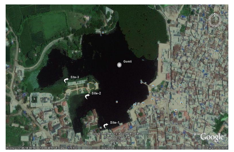
Figure 1. Holistic View of Dakor Sacred Wetland (DSW), Central Gujarat, India Sampling

Commission of India, 2004). It is the most worshiped temple of Deity Lord Krishna and has also become source of attraction for the people from all over the world (Figure 1).